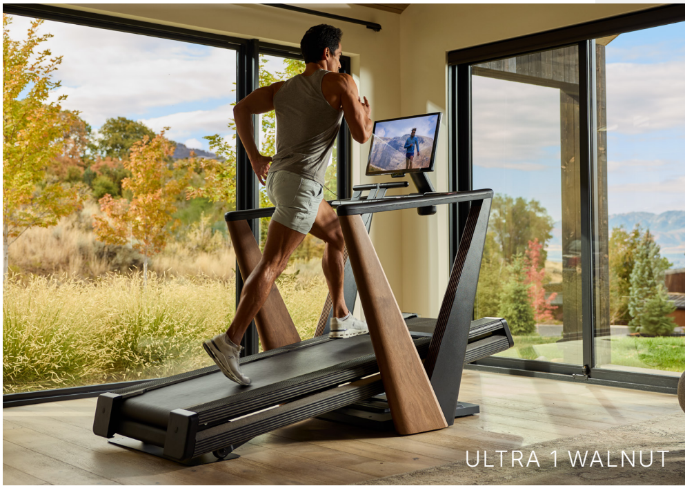
ULTRA 1 WALNUT